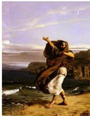
Demosthenes Practising Oratory (1870)

View the “Units of Analysis” and “Major Characteristics of Anthropology” slides above and use that information to check the Units of Analysis that you are using for your Project . . .