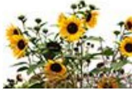
Global Cultures Week 10

228 Cina Hall 1123 University Drive Duluth, Minnesota 55812-3306 E-mail: troufs@d.umn.edu ZOOM: https://umn.zoom.us/my/troufs 20 March 2022